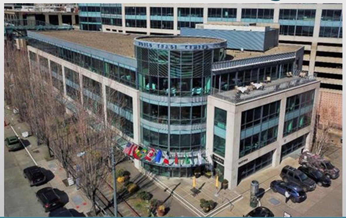
2200 Alaskan Way, across the street from the Pier 66 complex